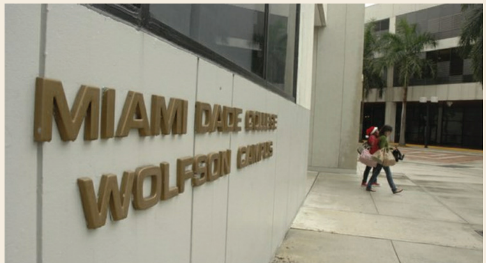
Wolfson campus in Miami Dade College.

The lawyers association claimed the litigation is not just over a college tuition refund, but it could have a ripple effect on nearly